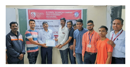
Students shine at Divisional Carrom competition: Claim for State Level

Students of Yashwantrao Bhonsle Polytechnic won the title by performing brilliantly in the divisional carrom competition organized for the technical institutes of Kolhapur division and proved their claim for the state level competition.