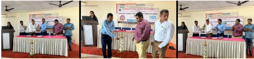
Inauguration Ceremony of MSBTE Sponsored Technical Paper Presentation Competition (Mumbai Region)