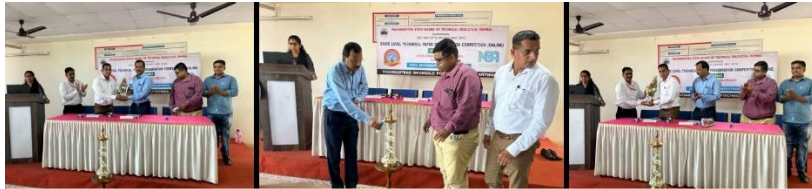
Inauguration Ceremony of MSBTE Sponsored Technical Paper Presentation Competition (Mumbai Region)